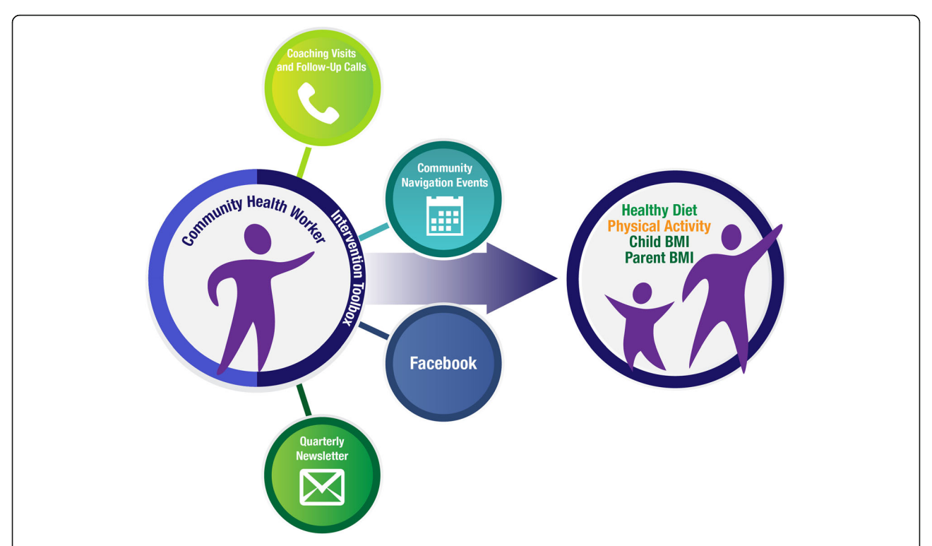
Fig. 2 Healthy Kids & Families Model. This figure is our own image, but the images used to create it were taken from the stock photography website (istockphoto.com) with permission to use them. https://www.istockphoto.com/legal/license-agreement

Borg et al. BMC Obesity (2019) 6:19 Page 6 of 13